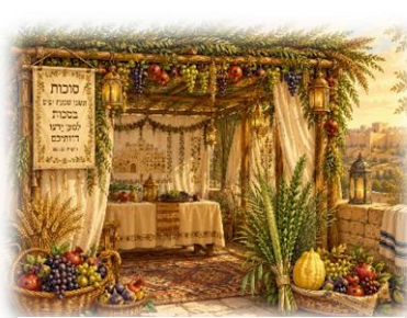
The feast of tabernacles or Sukkot

13 And that their children, which have not known any thing, may hear, and learn to fear the Lord your God, as long as ye live in the land whither ye go over Jordan to possess it.