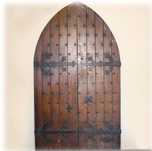
A gothic style door of two leaves

3 To him the porter openeth; and the sheep hear his voice: and he calleth his own sheep by name, and leadeth them out.