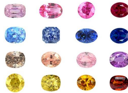
Sapphires come in a variety of colours