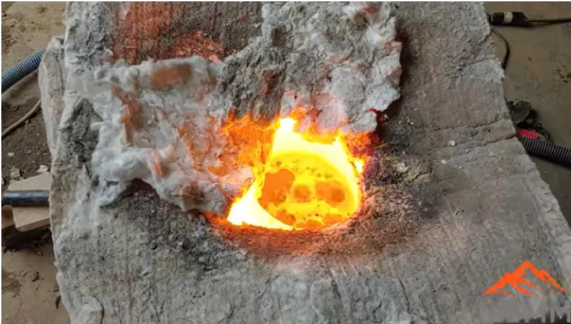
Small Blast Furnace – pretend this is old

The process of extraction was fairly simple. First, the lead ores were, in their simplest form, heated in a fire and the lead then sifted out from the ashes. Lead itself is of little value but almost always contains a small percentage of silver. This was freed from the lead by heating in a furnace with a bed of bone ash, which absorbs some of the lead.