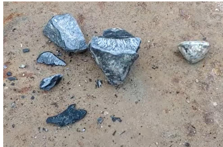
Waste Silver and Iron Mixed