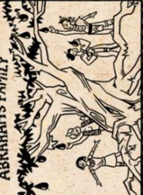
IMAGE of GOD BLESSING the NATIONS THROUGH ABRAHAM'S FAMILY

"I WILL HEAL THEIR WAYWARDNESS & LOVE THEM FREELY." v4