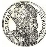
Jeroboam II 825 - 784