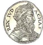
Ahaz 742 - 726 BC