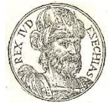
Hezekiah 726 – 698 BC