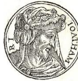
Jotham 758 – 742 BC