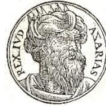
Uzziah 810 – 758 BC

2 The beginning of the word of the LORD by Hosea. And the LORD said to Hosea, Go, take unto thee a wife of whoredoms and children of whoredoms : for the land hath committed great whoredom, departing from the LORD.